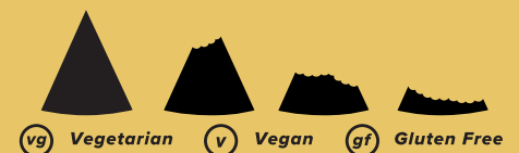
(vg) Vegetarian (v) Vegan (gf) Gluten Free

WE'RE NOT RESPONSIBLE FOR LOST ITEMS. A 6% SURCHARGE IS ADDED TO ALL FOOD & BEVERAGE SALES WHICH APPLIES TO THE COST OF SAN FRANCISCO EMPLOYER MANDATES AND ORDINANCES INCLUDING HEALTH CARE & MINIMUM WAGE. CONSUMING RAW OR UNDERCOOKED MEATS, POULTRY, SEAFOOD OR EGGS MAY INCREASE YOUR RISK OF FOODBORNE ILLNESS.